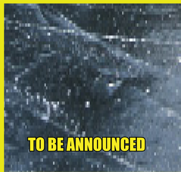
TO BE ANNOUNCED